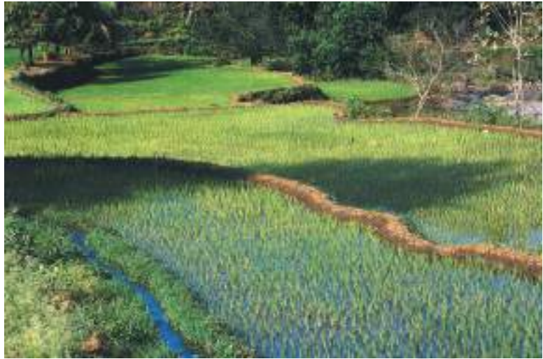
Transplanted paddy growing in a few of Ramalingam's 20 acres. A result of hard labour performed by agricultural workers like Thulasi.

This is when we can say they are caught in debt. In recent years this has become a major cause of distress among farmers. In some areas this has also resulted in many farmers committing suicide.