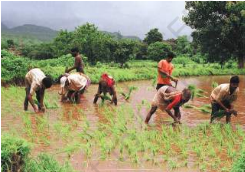
Transplanting paddy is back-breaking work.

The village is surrounded by low hills. Paddy is the main crop that is grown in irrigated lands. Most of the families earn a living through agriculture.